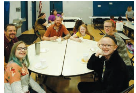
Enjoying Pastries with Parents

and the holidays), helped Project Woman set up for their candlelight vigil, and collected supplies for the Soup Kitchen, Free Store, and Parent Infant Center. Champions were crowned in the Baseball and Football Leagues. Ping Pong