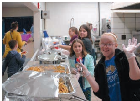
Serving guests at Student Council Waffle Breakfast