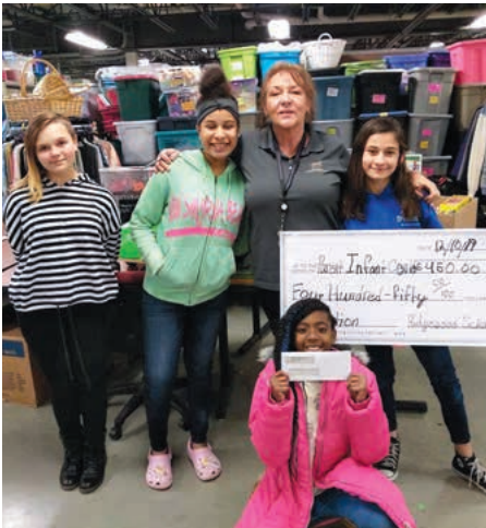
Presenting check to Parent Infant Center