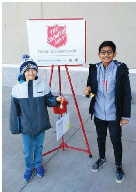
Collecting for the Salvation Army

and the holidays), helped Project Woman set up for their candlelight vigil, and collected supplies for the Soup Kitchen, Free Store, and Parent Infant Center. Champions were crowned in the Baseball and Football Leagues. Ping Pong