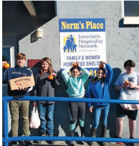
Delivering holiday cards and treats to the homeless shelter

Field trips and community service are two important parts of a Ridgewood education. Last spring's Hearts & Hands Auction's "Bid for a Cause" raised the