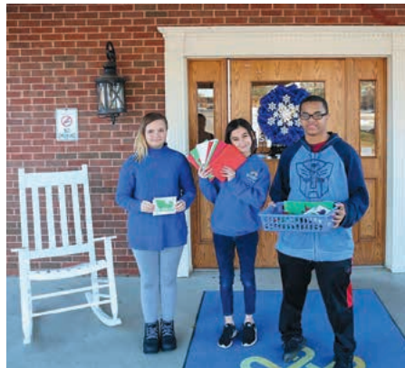
Visiting at Villa Springfield

During the first half of the year, students made monthly visits to volunteer at the Second Harvest Food Bank and mobile pantry, delivered cards and treats to local nursing homes and the Homeless Shelter (for Halloween, Thanksgiving,