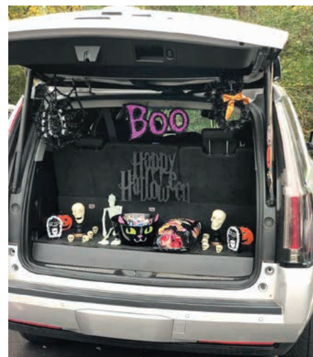
Trunk or Treat was just one of the fall activities sponsored by R.A.P.