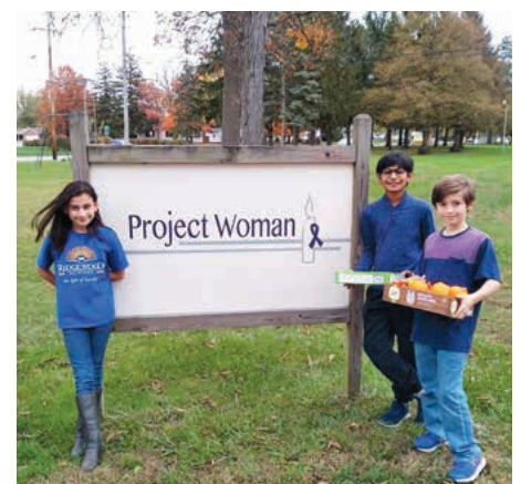
Helping Project Woman set up its candlelight vigil