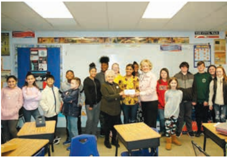
Presenting check to Breast Cancer Endowment Fund of Clark County