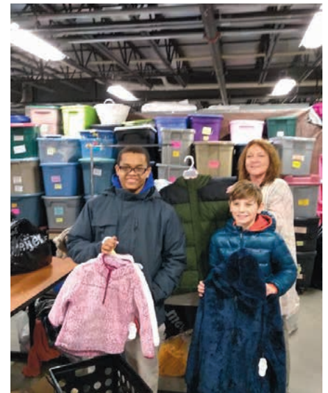
Donating clothing to Rocking Horse