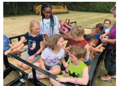
Students eagerly awaiting a hayride.