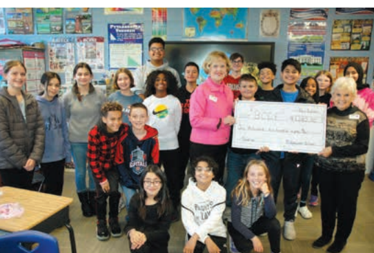
Students presenting check to Breast Cancer Endowment Fund representatives

In October, the Student Council ran a bake sale, waffle breakfast, and movie nights to raise $1,280 for the