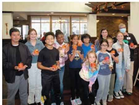
Students arriving at nursing home with Halloween treats for residents

November was a busy month which included the students making candles