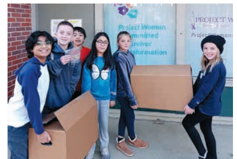
Students delivering treat bags and small gifts to Project Woman

Throughout the fall, students made cards to deliver to local nursing homes for Halloween and Thanksgiving as well as treat bags for kids at Project Woman and IHN. They volunteered each month at the food bank. In September, Ridgewood School was recognized at the annual