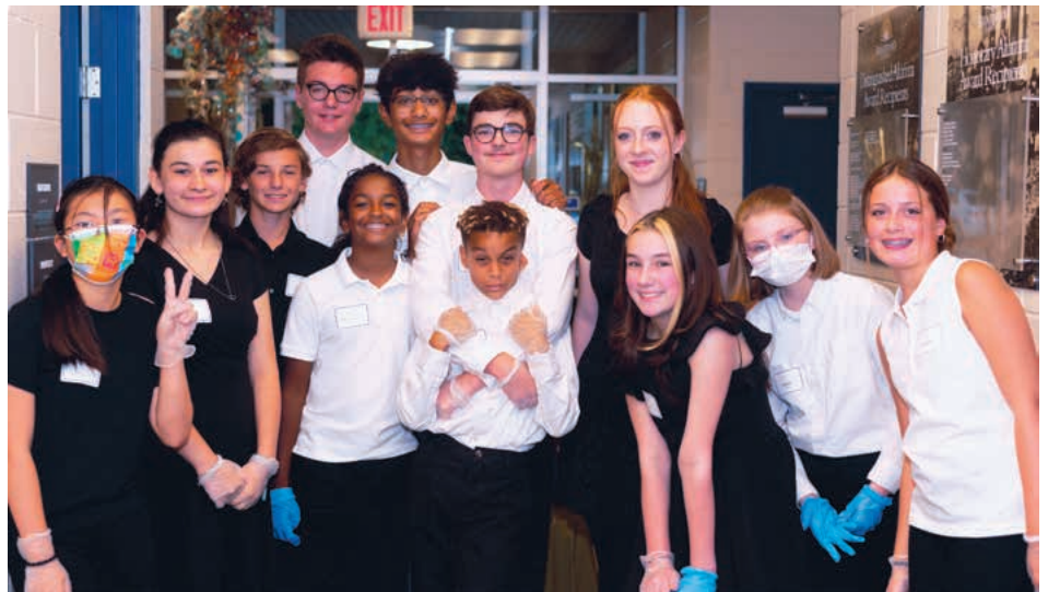
Students and alumni were servers at the Alumni Dinner

Breast Cancer Endowment Fund. The tradition of having a haunted house at the Halloween Bash continued with the 8th