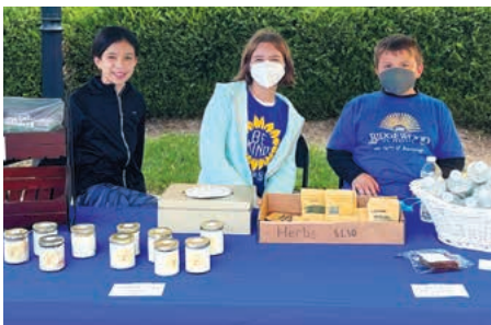
Students selling Learning Garden products at the Farmers' Market

In September, the Student Council was involved in a variety of events and fundraisers. They made cucumber salsa to sell at school using some of the items from our learning garden. They baked goods, packaged herbs, and made zucchini bread to sell at the Farmers' Market. During the weekend of Fall Fest, they were servers at the Alumni Dinner and helped with Fall Fest's dunk tank and concessions. The following week, students